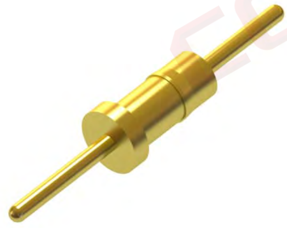
(Series Image-Reference Only)

DS1006-12 - X Pin plated 6: Full Tin 8: Full Gold flash Series No. DS1006-12