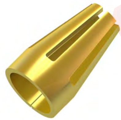
(Series Image-Reference Only)