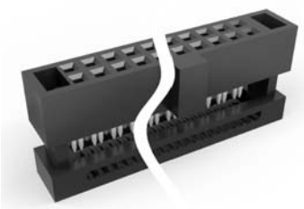
(Series Image-Reference Only)