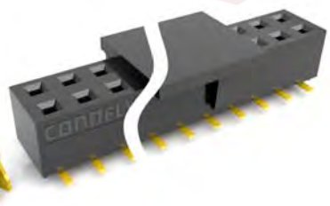
(Series Image-Reference Only)