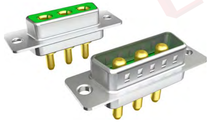
(Series Image-Reference Only)